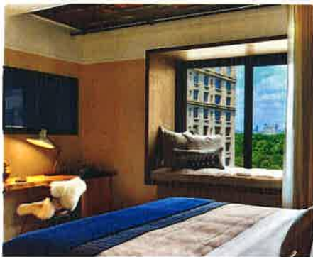
The perfect stay is moments away

Book your hotel with us and earn up to 10,000 points per night.