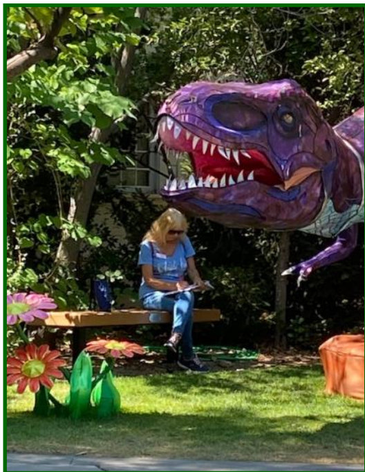
A student writing with a little help from a friend!

Many thanks to May Arboretum Society for all you did in July to make the class possible, and for what you do everyday to support the arboretum – a real Washoe County treasure.