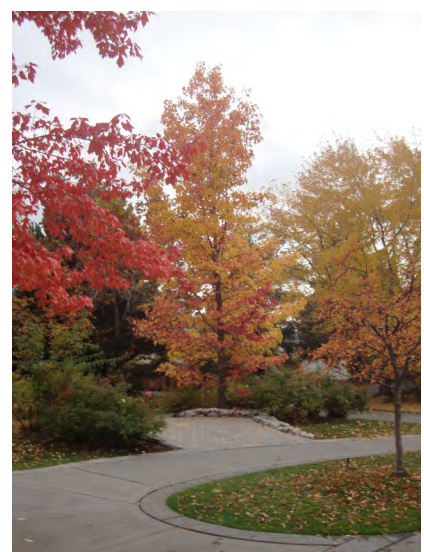
The Arboretum in full fall splendor. Thank you staff and volunteers!