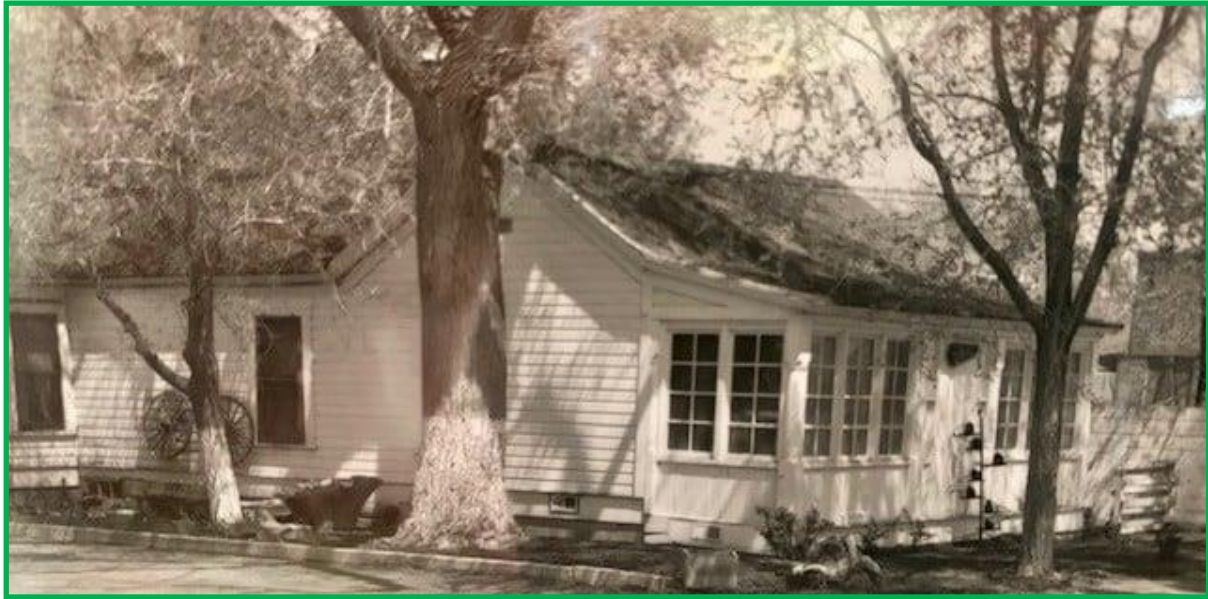
Rancho San Rafael Park is celebrating it's 40 year anniversary on July 3, 2022. Above is a picture of the original caretaker's cottage. Does it look familiar? It's current role is the park ranger's office.