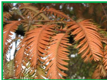
Left: The uniquely sculptural trunk of the dawn redwood. Center: Close-up of the autumn foliage. Right: the metasequoia in all of its fall glory.