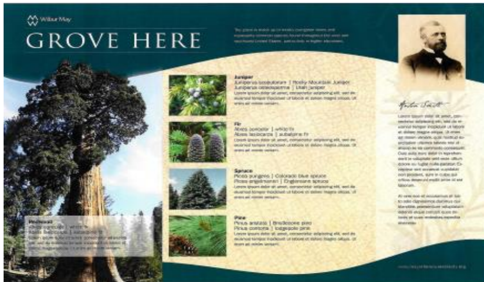
This is an example of how the interpretive panel might look and the type of information on it.

By this time next year or sooner you will notice in many of the gardens attractive colored interpretive panels. As a matter of fact there will be 35 of them throughout the Arboretum. Some will 36" X 24" and others, larger. The goal is to tell the story of the trees and plants, and their significance locally, while engaging kids of all ages. Some of the topics and information will include: the May Family history, climate and water and how it relates to plants, the Great Basin, wildlife food webs, indigenous peoples, and the native and non-native plants that live here. There will be fun and interesting facts about trees and plants in the Arboretum and the importance of them. There will also be a childlike caricature dressed as an explorer for the kids asking "Did you know?" with fun trivia. The goal is to enhance the visitor experience, by engaging the young and young at heart in their natural world, while providing a learning opportunity. This project has been a goal of mine since coming to the Arboretum in 2005 and it is now coming to fruition. Many thanks to the May Foundation, May Arboretum Society, the May Arboretum, private donors and Washoe County for supporting this project.