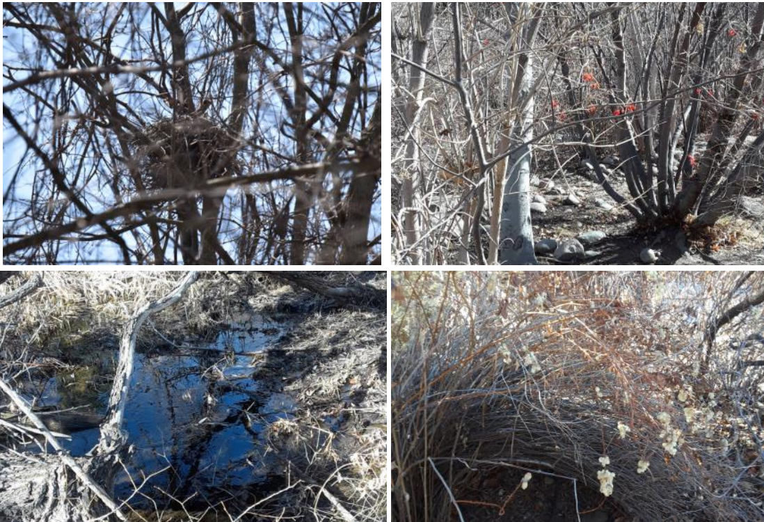
Clockwise from the top: Cooper's Hawk Nest, The last few berries on a Wentworth Cranberry Bush; a new view of Evan's Creek; and the last of the Snowberries.

There is plenty to see and experience in the last bits of winter before Mother Nature brings out Spring in all its bright glory.