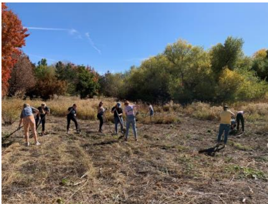
Photo Above: Kappa Alpha Theta Sorority digging up invasive Teasel in October 2019.

We are so thankful to all of the volunteers that have helped along the way, braving temps in the 30s and 90s and everything in between. We also are very grateful to Rod Dimmit and other Arboretum staff for supplying us with tools so we don't have to lug them so far, and for dutifully hauling the piles of weeds to the park dumpsters. It has been an exciting group effort, and we hope you look forward to joining us in future restoration efforts!