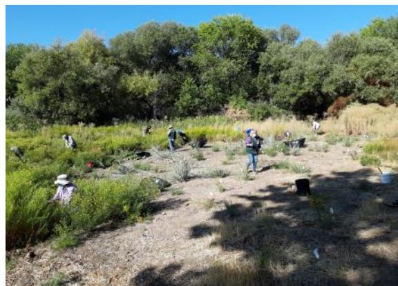
Photo Above Right: Arboretum Volunteers doing second year weeding and replanting in September 2020.