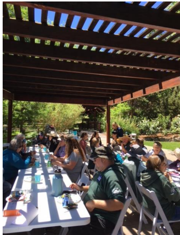
Sharing a wonderful lunch with Volunteers and Arboretum Staff under the pergola at Honey's Garden.