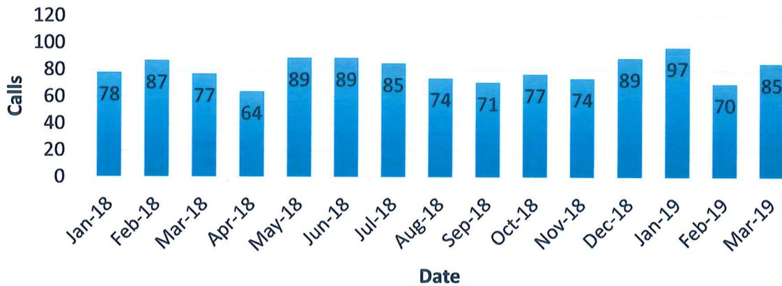
Calls for Service