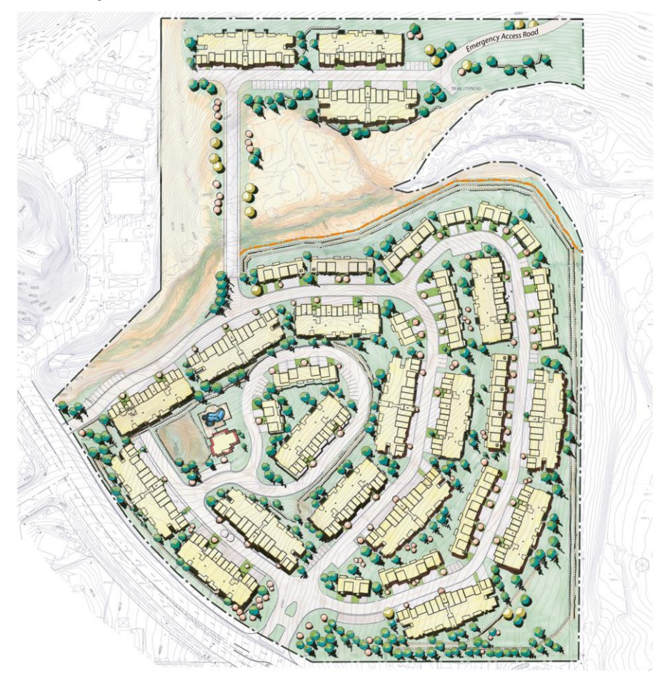
Figure B-2: Conceptual Site Plan

The Falcon Ridge Specific Plan allows a maximum of 269 lots with the average lot size of 1,285 square feet generally following the layout depicted in Figure B-2. The overall density will not exceed ±10.6 dwelling units per acre.