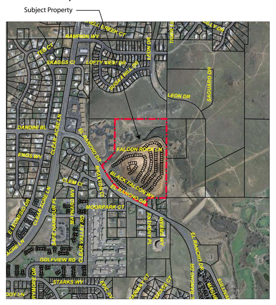
Figure B-1: Location Map

Falcon Ridge consists of 25.6± acres and is located on El Rancho Drive east of Sun Valley Boulevard in Sun Valley. Surrounding uses include single family residential to the south, apartments to the west and vacant land to the north and east. Figure B-1 depicts the location of Falcon Ridge.