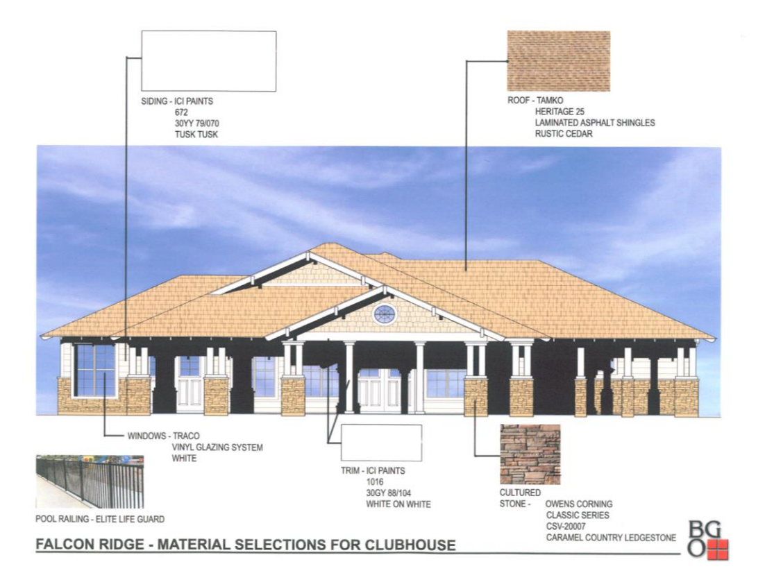
Figure B-4: Club House Architecture