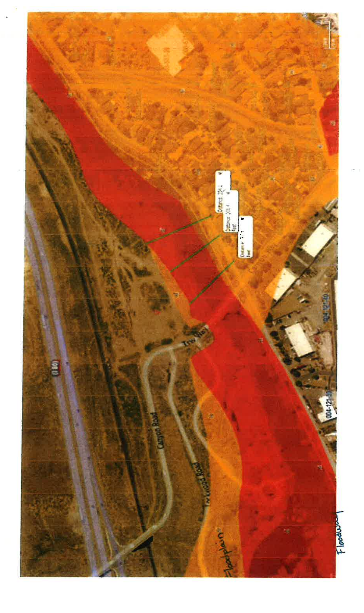
approximately 300-350 feet from the proposed industrial zoning area. The surrounding area is the Truckee River, The above map shows the existing single family residential neighborhood of Rainbow Bend located