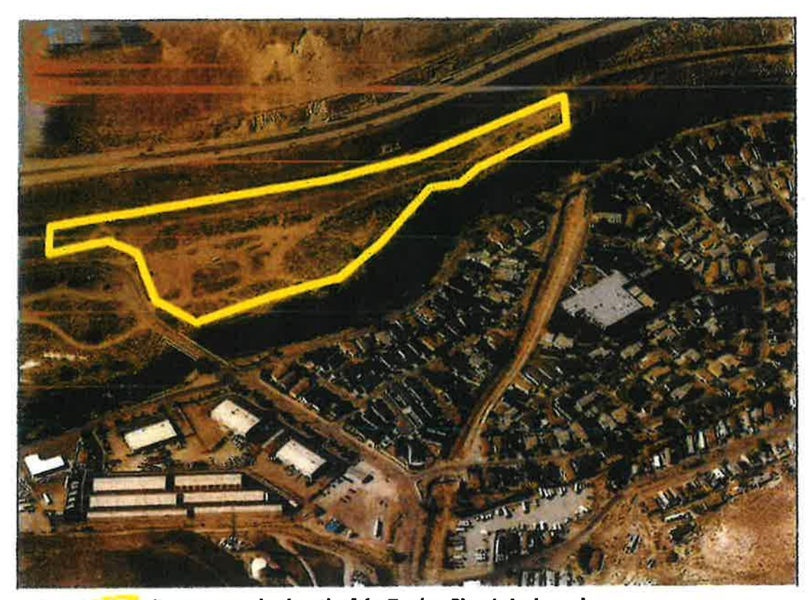
Figure 3.4-35: Adjacent vacant land north of the Truckee River in Lockwood. The image above shows vacant land in Washoe County that may be considered for transfer into Storey County.