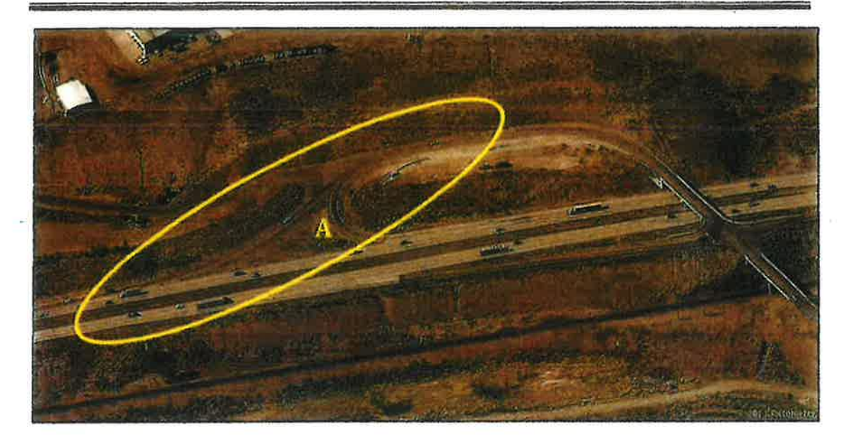
Figure 3.4-32: The images depict the existing infrastructure connecting Lockwood to Interstate 80. The image illustrates an on-ramp with substandard length for safe entry onto the interstate (A), and sharp and narrow curvature which inhibits safe two-way vehicle and truck travel (B).