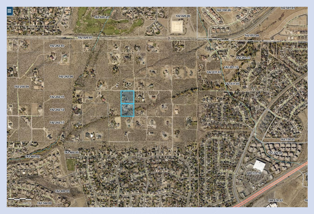
Washoe County Planning Commission August 3, 2021