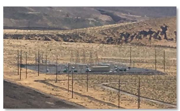
NV Energy's Pah Rah Substation