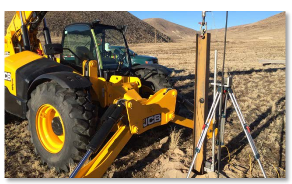
Geotechnical Analysis at Turquoise Solar Site