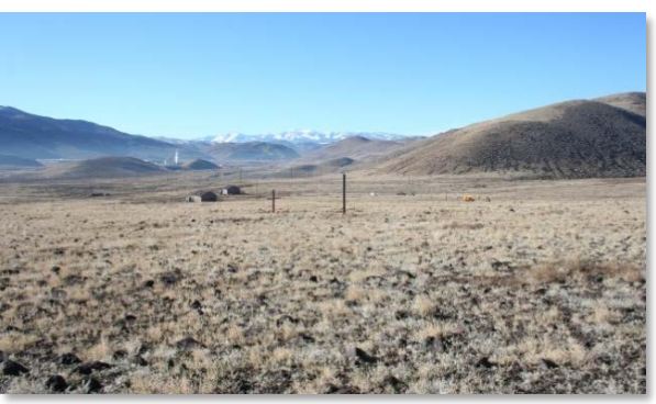
Turquoise Solar Array Site