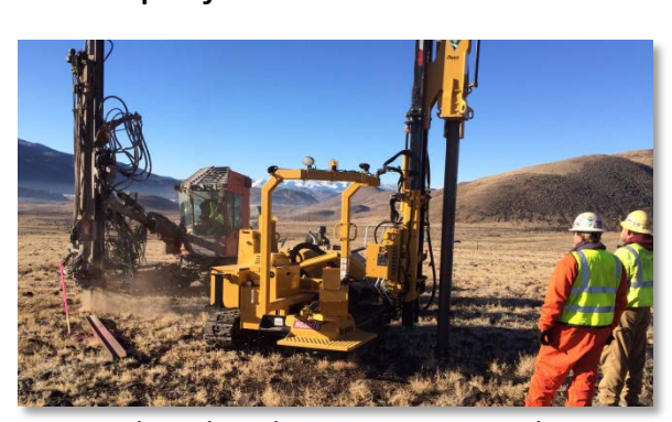
Geotechnical Analysis at Turquoise Solar Site