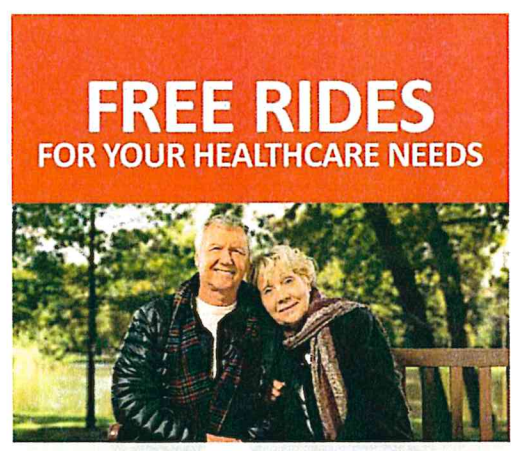
FREE TRANSPORTATION SERVICES FOR seniors or disabled, and/or low-income residents in Washoe!

Number of rack cards passed out since Jan. 2016 — 10,000