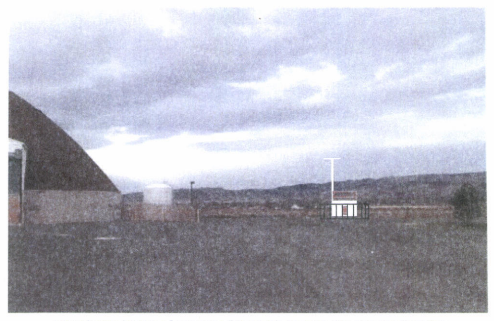
Visual simulation of proposed Spanish Springs Monitoring Station