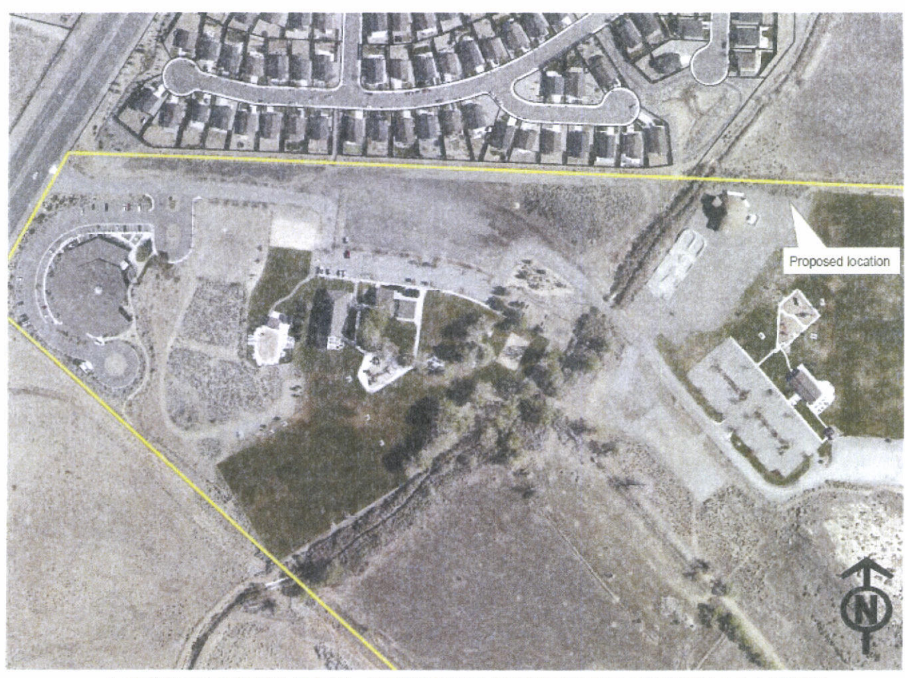
LAZY 5 REGIONAL PARK - PROPOSED MONITORING STATION LOCATION